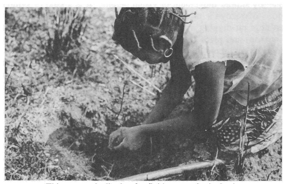
This woman is digging for field rats out in the bush.

It is a woman's story, for it dramatizes a relational problem causing great anguish to Chokwe women. Infertility—defined as childlessness more frequently than as sterility—is a gender-specific crisis. For although Chokwe men also desire children (fertility), it is men who divorce childless women to remarry and not vice-versa. A woman's fertility ranks among the top priorities for her success in marriage and for her self-realization as a woman. Her biological fertility not only promises a literal abundance—children, working hands, and enlarged influence—but also a symbolic fecundity indicating ancestral blessing.