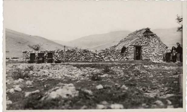
Fig. 2. Parry's phonograph recording apparatus in use in the village of Kijevo (Croatia). The amplifier and embossing units can be seen on the left side of the image; a singer, Ante Cicvarić, seated before the microphone, is visible in the doorway on the right.