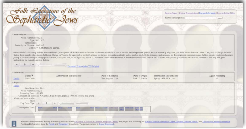
Fig. 3. Sample transcription of a ballad, associated metadata, and audio player link (<a href="http://sephardifolklit.illinois.edu/FLSJ/transcriptiondetails/1230">http://sephardifolklit.illinois.edu/FLSJ/transcriptiondetails/1230</a>).