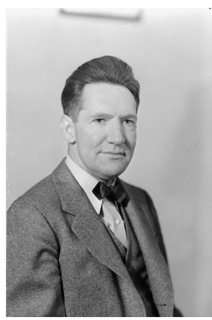
Fig. 1. James Madison Carpenter, circa 1938.

James Madison Carpenter (1888-1983) was until recently a relatively unknown figure in the history of Anglo-American folksong and British folk play scholarship (Jabbour 1998; Bishop 1998). Born and bred in Mississippi, he was university-educated and worked as a minister and