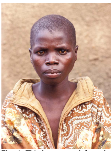
Fig. 4. This boy escaped from the Lord's Resistance Army (LRA) Rebel group five days before this photo was taken. The LRA is made up mostly of abducted children. October 2004.

Tens of thousands of "night commuter" children walked nightly, also without any form of adult guidance, to the three city