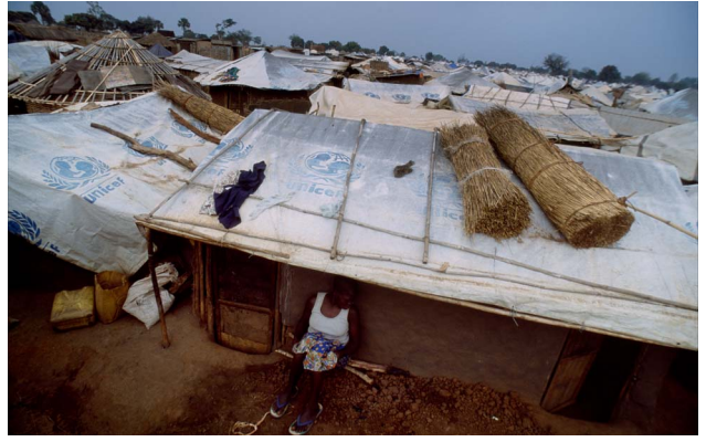
Fig. 1. Padibe Internally Displaced Person's Camp, Northern Uganda. January 2007.

the cease-fire of the previous year and a half had changed things considerably. People all over Acoliland<sup>1</sup> (Northern Uganda) had begun to return to their villages after a decade of forced displacement into squalid camps, where inhumane conditions killed—according to one study—in excess of about 1,000 individuals per week (UMH 2005). Like much of the 90% of the population who had been forcibly displaced, Nyero's family was planning to return to their "traditional" village at the end of the year. Finally, land was being cleared, seed sown, water wells checked, gardens planted, grass cut, and huts built.