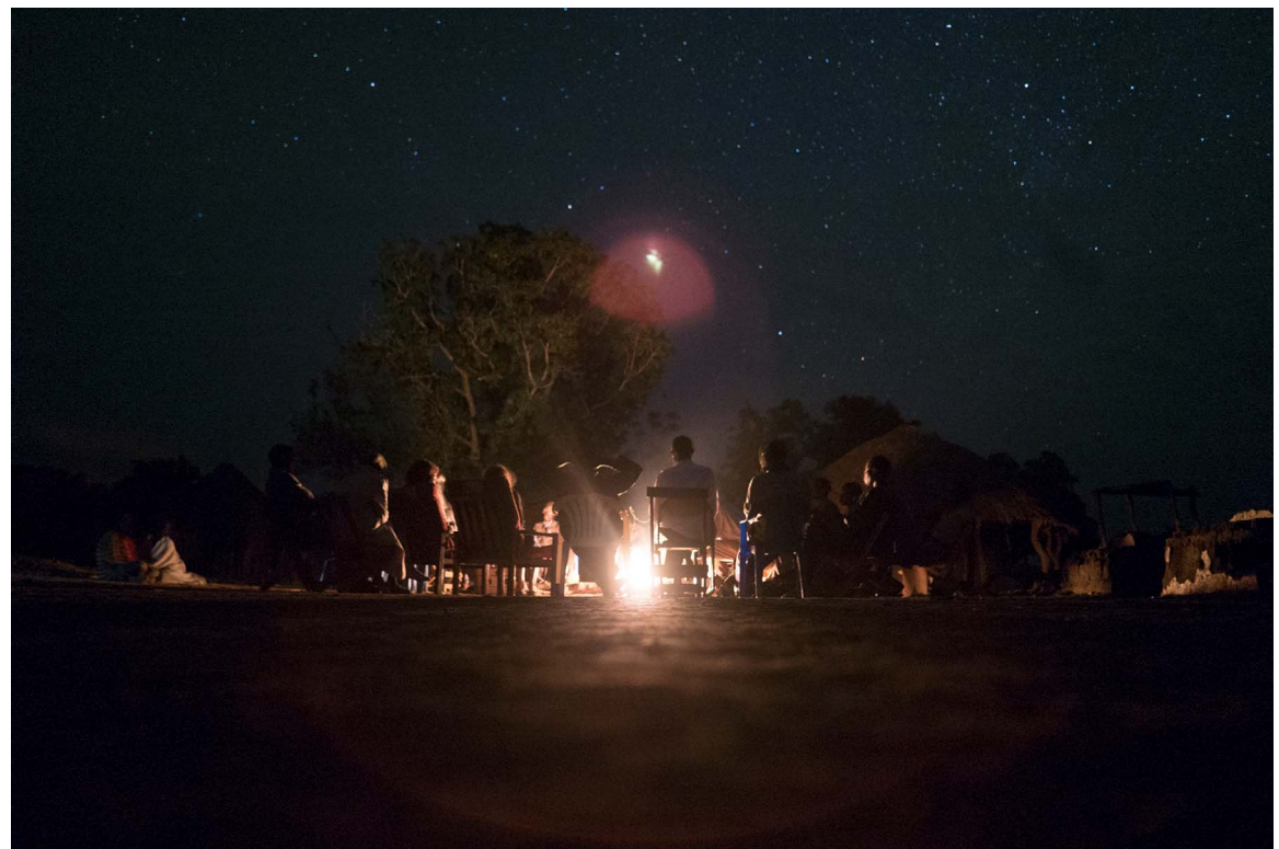
Fig. 11. Wang'oo (nightly fireside gathering) in Pabwoc-East village. August 2012. Photo by Ryan Gauvin. Full reproduction permissions given.

Today, despite the tumult of the displacement and war years, lineage, sub-clan, and clan structures and practices have all strongly, and perhaps surprisingly, revived since the return to the land. Wang'oo have also mostly returned. According to my village survey, approximately 85% of households engage in this practice within their own compounds or visit an elderly family member to practice with them. In addition, 100% of Pabwoc-East residents now survive upon subsistence farming.