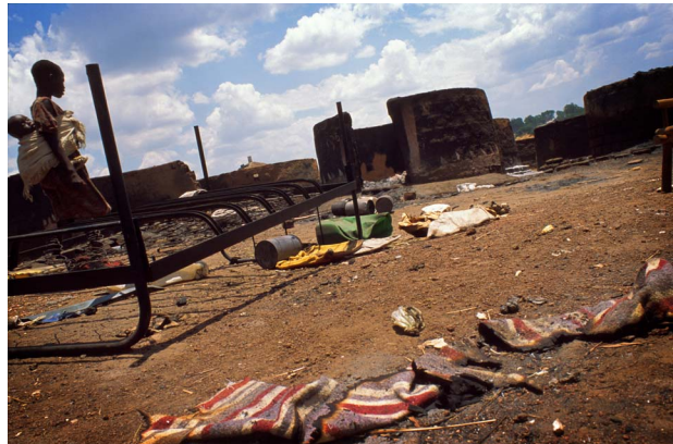
Fig. 6. Fires that spread quickly throughout the IDP camps were quite common due to massive overcrowding. Anaka IDP camp, March 2005.

Within the IDP camps, one could see the devastating effects of the war on everyday patterns of residence, social relations, and activities. For example, wang'oo , nightly fireside storytelling that acted as a vital mode of social control and education, fell out of practice. Because of a lack of firewood, imposed curfews, and the dense population of a camp with huts built quite close together, wang'oo was no longer feasible or safe.