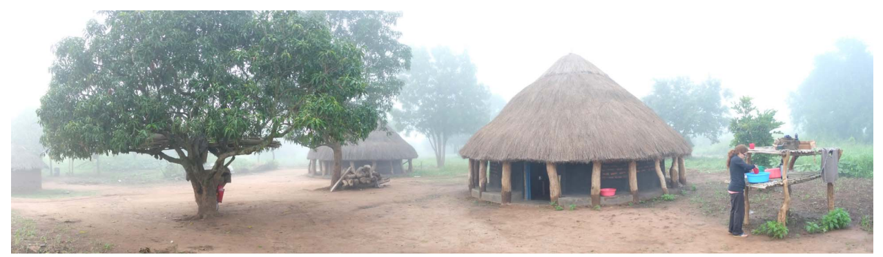
Fig. 3. Author washing dishes in front of her hut in Pabwoc-East village. August 2012. Photo by Ryan Gauvin. Full reproduction permissions given.

of families' histories during the war and their perceptions of tekwaro . Group interviews were held with lineage and chieftain councils within Padibe West and East Sub-Counties, as well as with groups of youths in five villages. Village-wide kabake (debates) were held in those same five villages in March and April 2012. In addition, I participated in and followed a youth group's "cultural revival" programming within Padibe East and West Sub-Counties from March to September 2012.