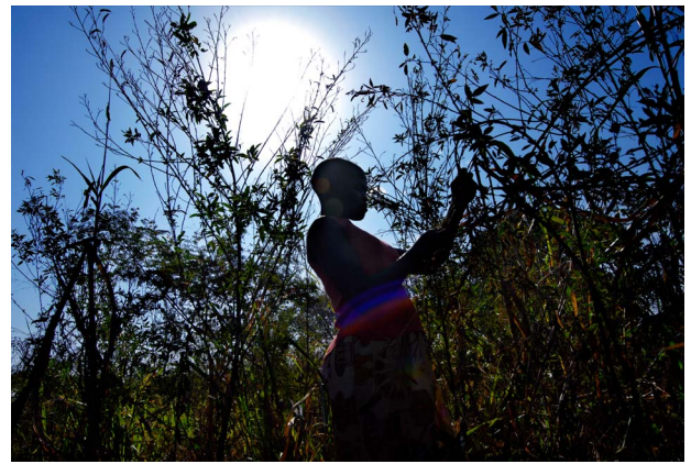
Fig. 7. Beatrice harvests peas ( lapena ) on her neighbor's plot just outside Padibe IDP camp. January 2007.

In addition, with no or limited access to their gardens, youths grew up alienated for the most part from everyday practices of subsistence farming, traditional foods were replaced with World Food Program emergency aid, and food preparation routines (which most other daily activities in this rural context aimed at supporting) were significantly altered.