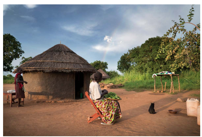
Fig. 10. The homestead of the author's family in Pabwoc-East village, Lamwo district, Northern Uganda. September 2012. Photo by Ryan Gauvin. Full reproduction permissions given.

Almost everyone in Pabwoc Village was displaced from their land in 1997 because of the war. Then most residents traveled to Kitgum—the capital of their district at the time—on account of increased rebel and military activity around their