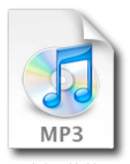
PN 654, II:92-93, R 936: 0:51-1:09

N [through laughter]: Where would you like to go, to heaven or to hell?