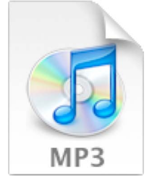
The Grey Album "Glass Onion + Encore"

When we shift our focus into the contemporary world, we find that this practice of remixing is also especially prevalent in today's popular music. The majority of rap and hip-hop songs sample, recombine, and remix music from other genres, but a new trend that takes this practice even further has been emerging within pop music over the past two decades. "Mashups" are songs that take two or more songs and rearrange them in order to have parts of one song (vocals or melody or rhythm) playing simultaneously with parts of another. One of the clearest examples of this practice is 2004's The Grey Album by DJ Danger Mouse, which lays the vocals from Jay-Z's The Black Album over instrumentals from The White Album by The Beatles.<sup>11</sup>