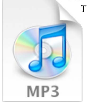
Night Ripper "Smash Your Head"

Though Girl Talk, whose real name is Gregg Gillis, creates these mashup albums, he does not get permission from the artists whose songs he uses, claiming that his work is protected under the doctrine of "fair use" (Gillis 2008b). When Gillis performs live shows across the nation, each performance is unique. He does not play the songs from his albums, but instead creates new pieces for each show. Some pieces may resemble those from a previous show, but as he tours and new songs come out, Gillis reworks and remixes songs for the next show. Girl Talk's albums are captured performances, 12 but his live performances are dynamic and ever-changing. Girl Talk is an artist who works with oAgora assumptions and approaches to his medium.