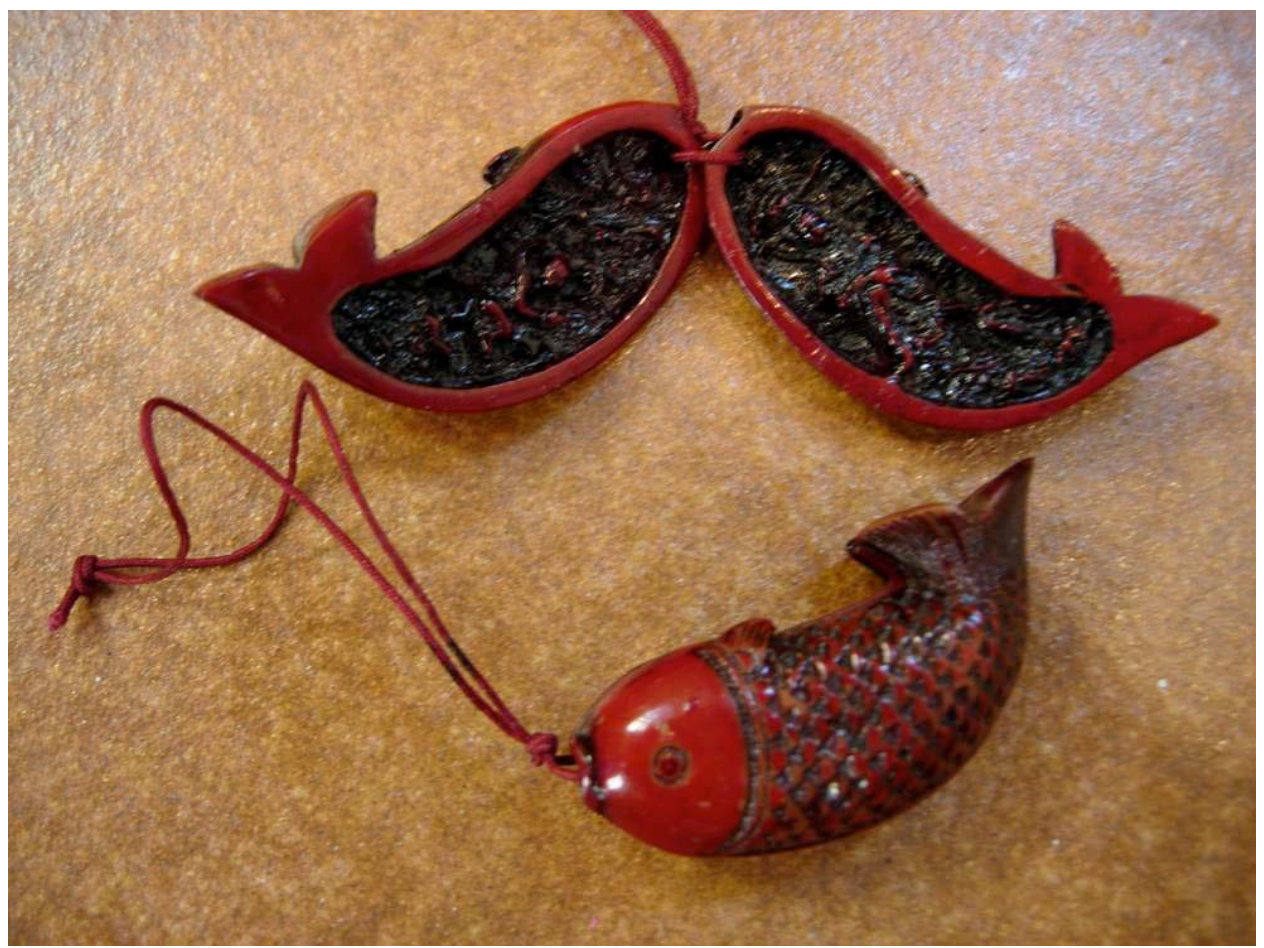
Figure 4. Amulets bought on the steps leading up to the Yongshuo terraced rice paddies. The seller explained that one carving inside shows a Bodhisattva Guanyin figure; the other side shows a child. The current amulets are made of inexpensive plastic, but a magnifying glass shows a feminized Guanyin figure.

inside of the other half of the fish was a small child that the Guanyin was said to protect (Figure 4).