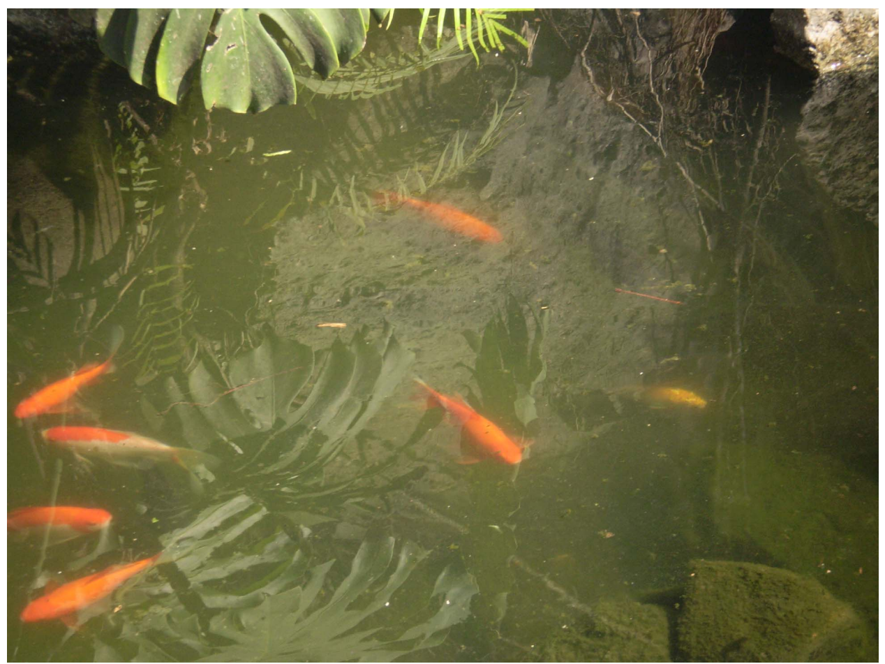
Figure 3. Directly below the Guanyin statue in Figure 2 is a "Pond of Mercy" where small red fish are currently released to acquire good luck.

This statue was said to have been moved to this location from another site to replace a Tang Dynasty statue smashed in the Cultural Revolution. What was most interesting was the small pool set among rocks directly under Guanyin. In the pool swam small bright red goldfish.