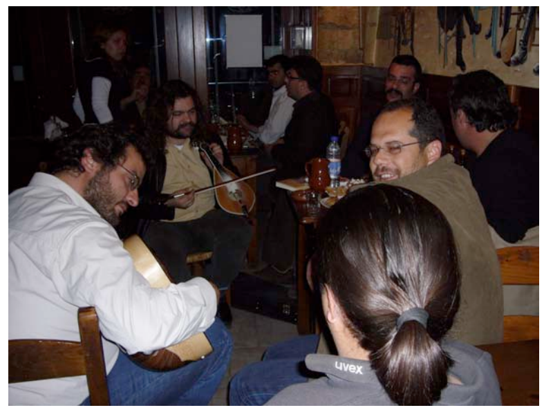
After midnight, a paréa has gathered around the two musicians who began the performance, and new performers now take turns. Mesostráti, Réthymnon. May, 2007.

Even today, among those most dedicated to Cretan music song, traditional musical parées do form. During feasts, or due to a private celebration, people come together to perform privately, taverns there are mezedopolía<sup>19</sup> that encourage people to perform. A musical paréa is most likely to gather around at least one instrument the mandolin, laoúto , lyra or violin—but the lack of instrument is not an insuperable obstacle. Mantinádes are sung in turns by fluent singers, or if possible by all present one-by-one in a circle, with each song always thematically connected to the previous one.