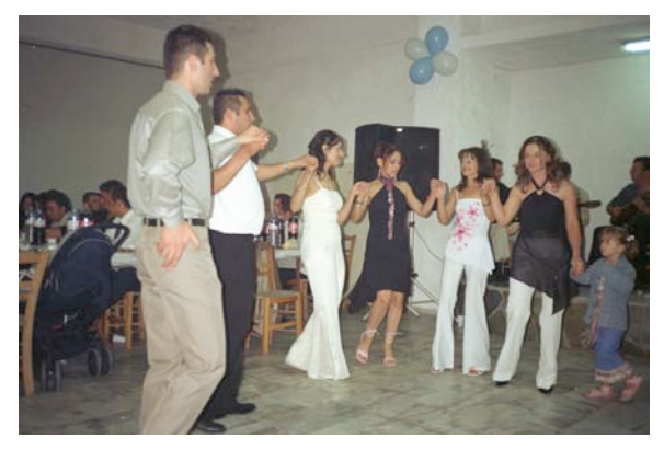
A local ensemble in a baptismal glénti held at the village society's festival hall. Milopótamos, October, 2004.

The organization of these festivities in the village is an amazing collective effort, in which reciprocity, and a sense of solidarity, is shared among the relatives, co-villagers, and friends involved. During the summer season, well-known Cretan musicians participate in panigiria in different villages nearly every day, either in the kéntra or in the village square. In the latter case, the village society or the local athletic society can organize the events, and the profit from the food and drinks sold provides the necessary income for its activities. Successful villages have good organizations and regular feasts, advertised with posters throughout the community.