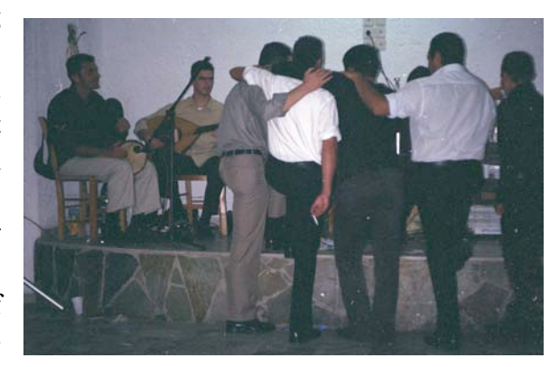
The paréa of the father and godfather singing mantinádes at the end of the evening.

During the late hours, and after warming up by consuming alcohol and partaking of the social atmosphere (just like in the traditional village environment), a paréa may take up a most traditional dialogue in mantinádes . Often, when the glénti starts to break up and the large audience has dispersed, a paréa of those most involved (for example, the bride's male relatives, the groom, the father, and the godparent) gathers in front of the musicians and is given the microphone to sing. Audience participation in singing is also a very popular part of late-hour performances in the music clubs in town during the winter season.