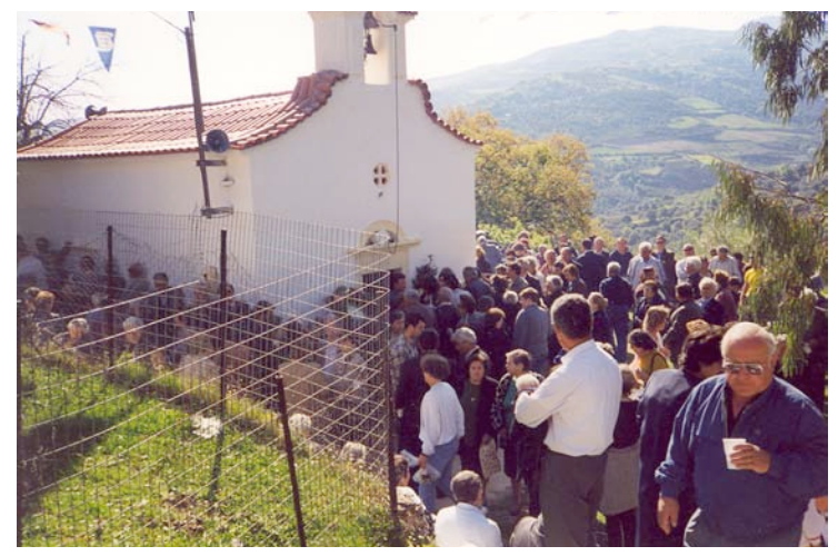
The panigiri of Saint George (the 23<sup>rd</sup> of April) in Así Goniá, 1997.

The glénti is the feast, the entertainment after the ritual acts and religious ceremonies. The village saint festivals start with a mass in the evening prior to the day. The principal mass is conducted early in the morning, and followed by the breaking of a special sweet church bread, a Lenten food, or another food typical of the day. The culmination of