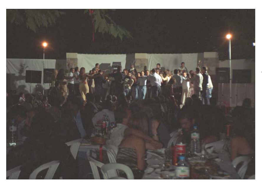
A marriage glénti in an open-air kéntro in Anógeia, September, 2006.

During the 1970s, most of the weddings or baptismal gléntia were transformed from village squares to special permanent or seasonal commercial centers of entertainment, kéntra (sing. kéntro ). These were built first in the urbanizing centers after the Second World War, and from the 1970s onward throughout the whole island, inspired by the (politically launched) wave of interest in the endemic musical tradition (Kapsoménos 1987:15).