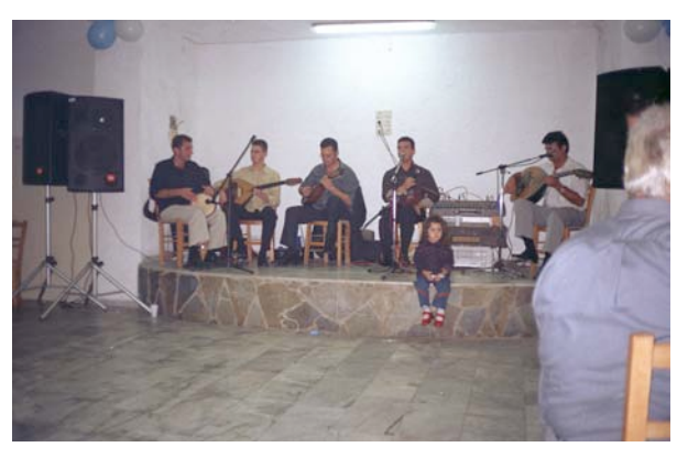
Parents, godparents, and close relatives begin the first dance to the sirtós tune.

The musical and singing activities in these festivities are entrusted to professional musicians, and creative audience participation takes place mainly through dance. The dances are booked with the head musician for a family or paréa on behalf of one of its members. Each group then takes turns dancing when announced. The musicians either sing traditional verses or verses from their own repertoire, which may contain their own compositions, but most often consist of mantinádes written by a mantinadológos , a mantináda -poet (it is generally thought that musical and verbal creativity are different, and that only rarely are both present in one person).