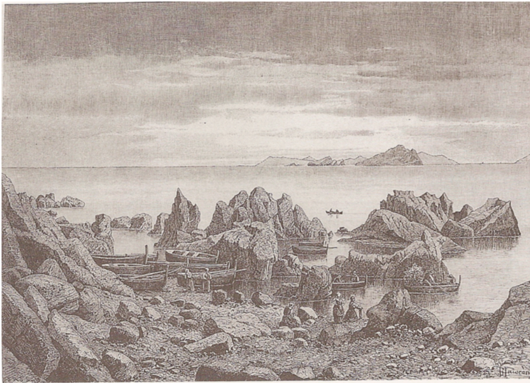
U Purtusu, the harbor on Stromboli that leads to the village of Ginostra. The Guinness Book of World Records calls this the world’s smallest harbor.

Injustice and villainy are the themes of “La Canzone i Ninu Murina.” The plot centers on Ninu Murina, an old man with an invalid wife, who hires a younger maid, 4 Annunziata; Nuzza, as she is called, becomes Ninu’s lover, making him sign over his property. The gull-and-knave plot was a familiar feature of Roman comedy; the roles of a servus callidus (cunning slave) and a senex amator (elderly lover) were stock characters in comedies by Plautus